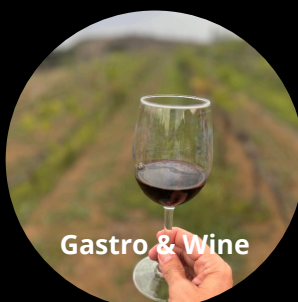
Gastro & Wine